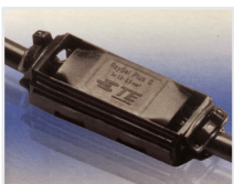
GVK_KGEL IP68 GEL CONNECTOR