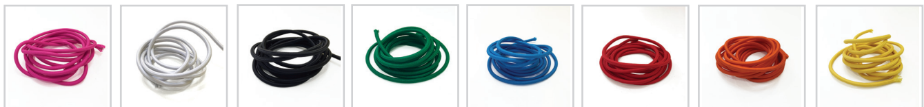
pink white black green blue red orange yellow