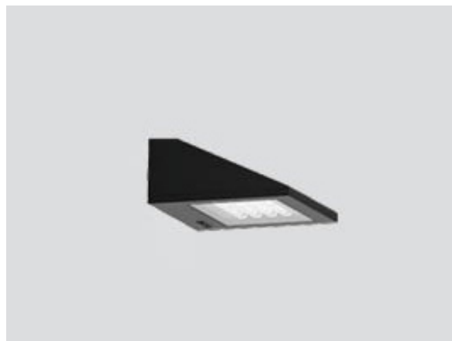
Ligman Exterior Vekter