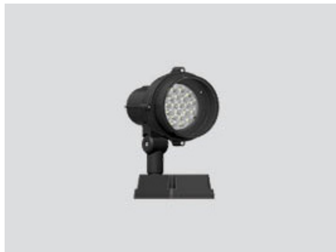
Ligman Exterior Mic Floodlight