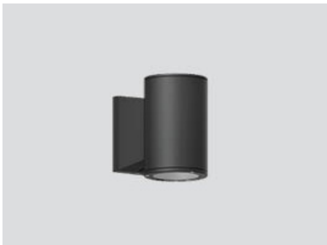
Ligman Exterior Jet Surface