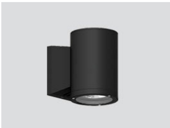
Ligman Exterior Tango Surface