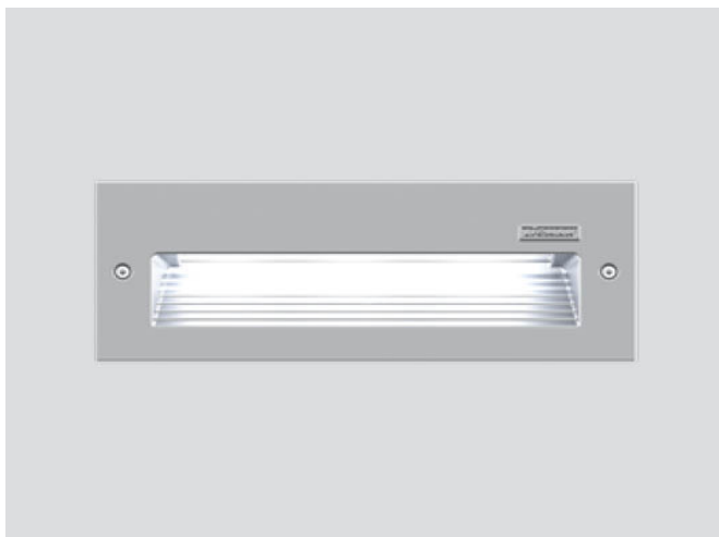
Ligman Exterior Rado