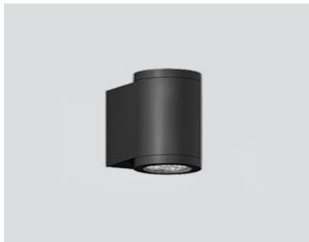
Ligman Exterior Marvik