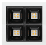
BLACK IN WHITE