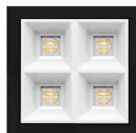
WHITE IN BLACK