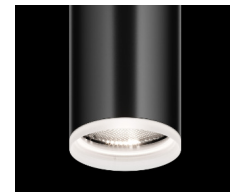
HALO RING FPL50.HALO

A deep 17mm baffle to provide extra visual comfort in sensitive areas. Supplied in black as standard. Supplied in place of the standard baffle. Easily retrofitted by removing the existing baffle.