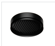
HONEYCOMB LOUVRE FFL50.HONEYCOMB

Used to provide additional glare control in sensitive areas. Easily installed by placing behind the luminaire baffle.