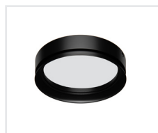
IPX4 LENS FFL70.IPX4

High quality borosilicate glass filters for premium colourfast performance. Available in a selection of colours. Easily installed by placing behind the luminaire baffle. Only available with remote gear