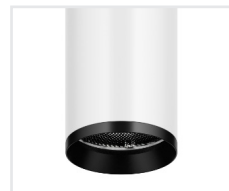
XL BAFFLE FPL70.XLB

A clear IPX4 lens. Required to be installed at time of manufacture. Only available with remote gear