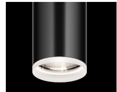
HALO RING FPL70.HALO

A deep 17mm baffle to provide extra visual comfort in sensitive areas. Supplied in black as standard. Supplied in place of the standard baffle. Easily retrofitted by removing the existing baffle