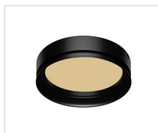
SPECIALTY COLOUR FILTER FFL70.COLOUR.XXX

Used to provide additional glare control in sensitive areas. Easily installed by placing behind the luminaire baffle.