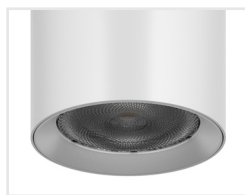
IP54 LENS FSL100.IP54

A discreet glowing ring attachment that emits a soft glowing light. Supplied in place of the standard baffle. Easily retrofitted by removing the existing baffle.