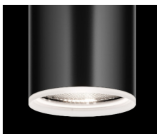
HALO RING FPL100.HALO

A discreet glowing ring attachment that emits a soft glowing light. Supplied in place of the standard baffle. Easily retrofitted by removing the existing baffle.